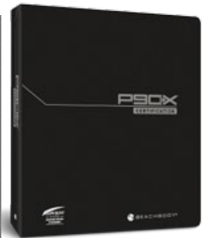
P90X Certification Course Manual