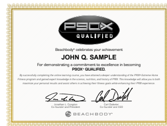
P90X Qualified Diploma