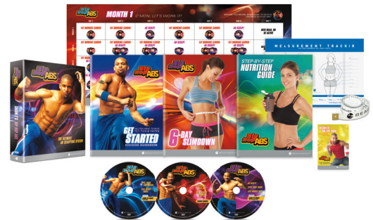
Hip Hop Abs