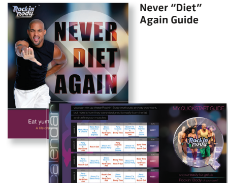
My Quickstart Guide

My Quickstart Guide is a workout calendar that tells you which workout to do each day, and the Never “Diet” Again Guide shows you how to eat simply and healthfully so you can lose weight without strict diets.